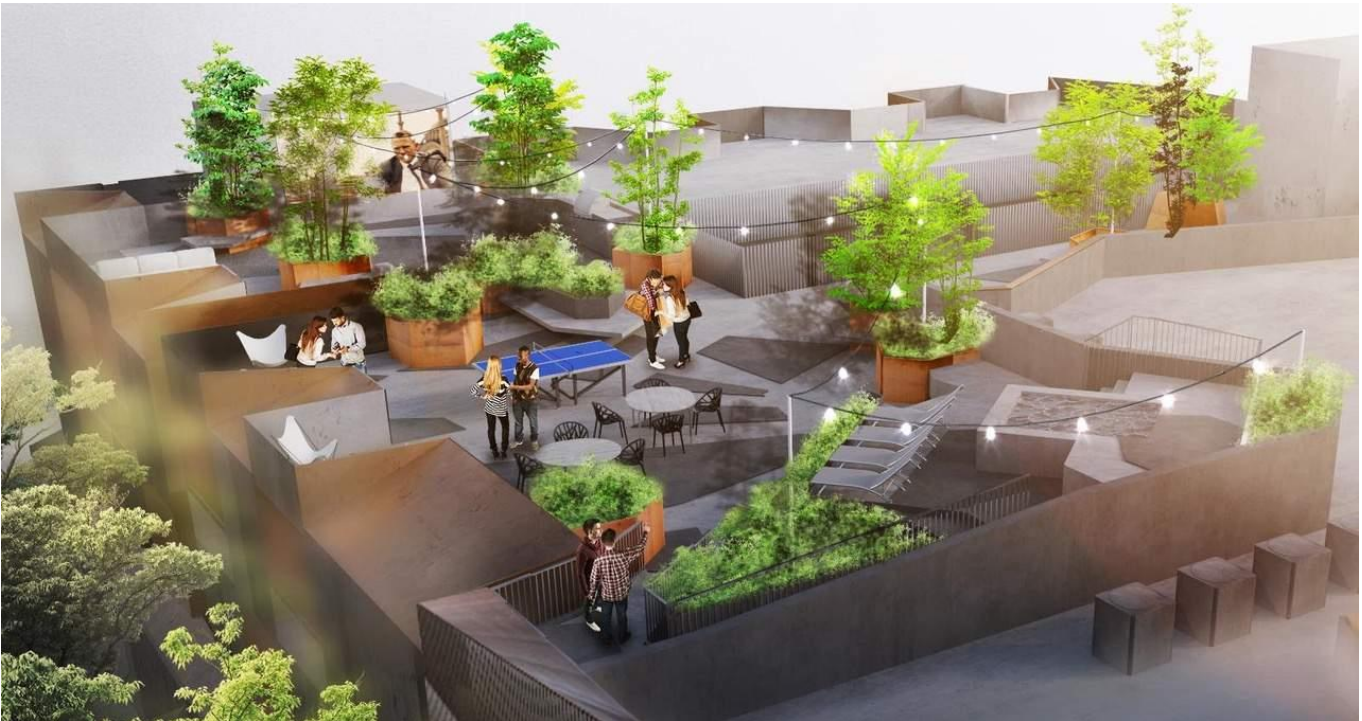
Rendering of a rooftop amenity deck at Broadway & Cloverfield