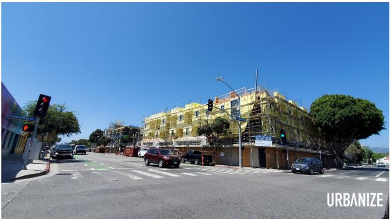
View from Broadway and Cloverfield looking northwest

September 27, 2021, 12:45PM Steven Sharp