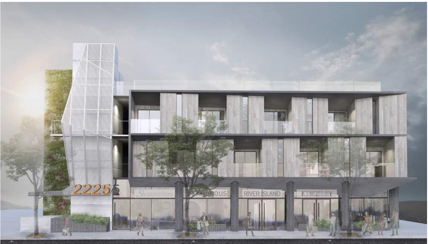
View from Broadway and 23rd