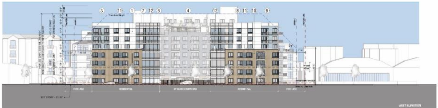
East and west elevations TCA Architects

The project's design team remains unchanged from the original plan, with TCA Architects serving as architects and MJS Landscape Architecture as landscape architect. As with the prior iteration, the building is described as being a contemporary California Coastal modern style with an exterior of plaster, wood, glass, and metal. Planned amenities include a pool deck and a courtyard.